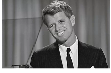
Your IQ Is At Least 129 If You Can Pass This Offbeat