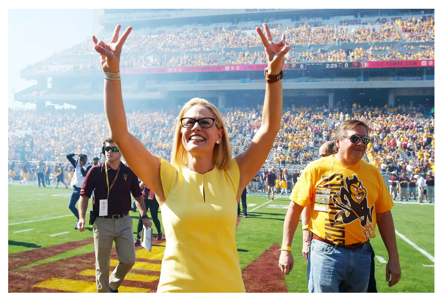
Dem. Kyrsten Sinema, D-Ariz. performs the coin toss before an NCAA college football game between Arizona State and Utah, in Tempe, Arizona, Nov. 3, 2018.