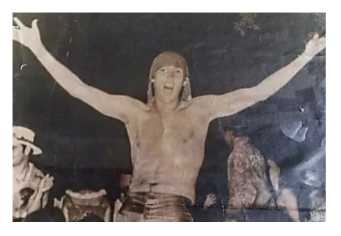
20 Photos of Young Donald Trump You've Never Seen Before Definition