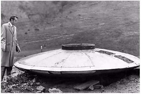
[Gallery] Declassified Photos That Caused Major Controversy Throughout History Herald Weekly