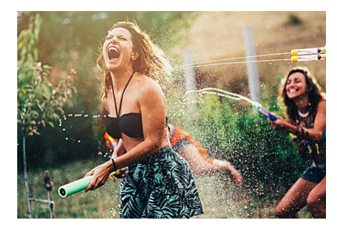
6 Credit Cards You Should Not Ignore If You Have Excellent Credit NerdWallet